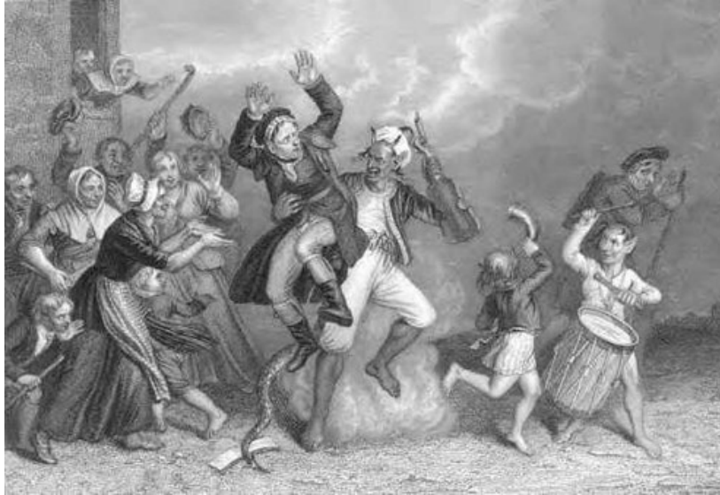
Old comic representation of the Devil with a fiddle

who are not our husbands and wives. A subtle form of fornication is still fornication, and there certainly are degrees of sin. The blatant abuse and extreme of this can be found in the night clubs, which are designed to be nothing less than a complete bombardment of the senses, with drink, drugs, music and dance designed to inflame lust, and draws the unsuspecting victim down the road of hedonism.. The whole experience is designed to parade a man or woman to the extremes of vanity, with clothing that turns a human into a clothes horse, a sexual object not a person, no more than an animal, reducing the whole event into a sense dulling meat market, which usually attracts the worse sorts of character and behaviour, not the best. It is obvious to all, that places such as this, are often celebrated as a hot bed of sin. It is sin which is the Christians enemy and wherever he sees that foe he is on his guard. That is why wise Christians are wary of something which the world is blind to, or if they see it, do not see the danger, because the concept of sin is not a serious one in the unconverted mind. So it will carry them away. Anyone who is serious about discovering the deeper things in life should run a mile from these places. Godliness and 'worldliness' are like oil and water.